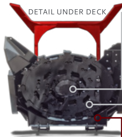
DETAIL UNDER DECK

Bolt-on push bar, intake chute and discharge deflector can be replaced with ease.