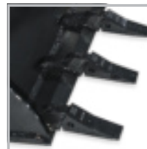
WELD - ON TEETH