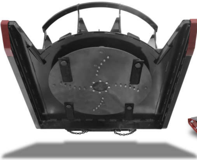
DETAIL UNDER DECK (Shown with Optional Teeth)