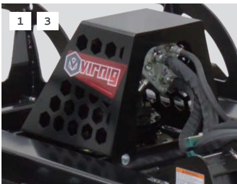
1. DIRECT DRIVE EATON® MOTOR WITH RELIEF VALVES