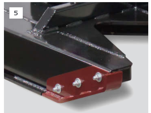
5. REPLACEABLE FRONT SKID SHOES