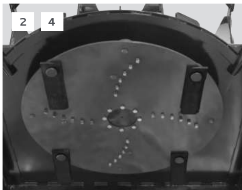
4. CIRCULAR FLYWHEEL WITH 4 DOUBLE-SIDED BLADES BOUNCES OFF STUMPS