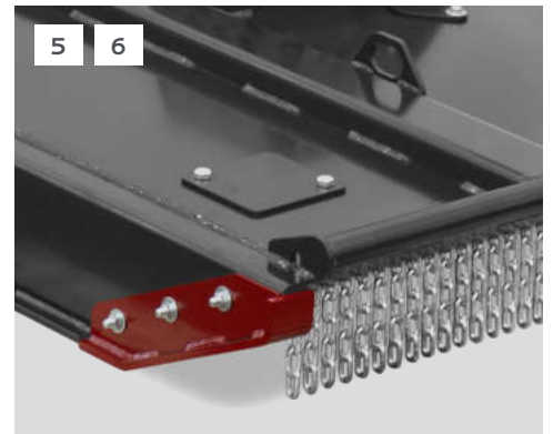
6. REPLACEABLE FRONT SKID SHOES