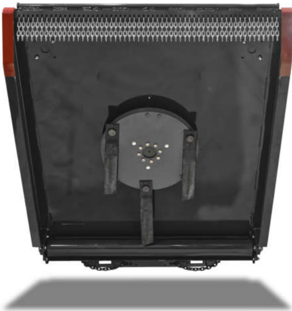
DETAIL UNDER DECK