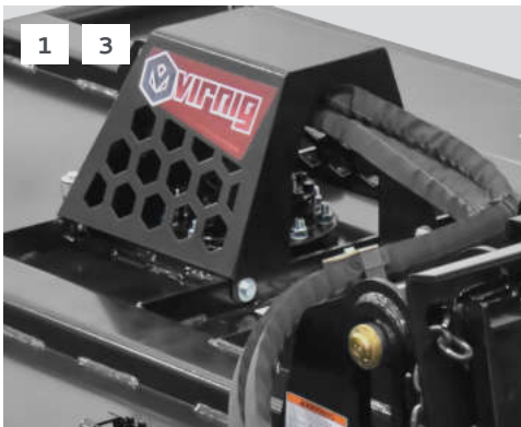
1. DIRECT DRIVE EATON® MOTOR WITH RELIEF VALVES