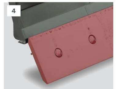
4. 5/8" x 6" REVERSIBLE STEEL BOLT-ON EDGE ALLOWS 3 1/2" OF WEAR