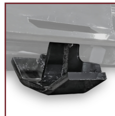
OPTION: QUICK TACH SHOES Helps keep the blade level.