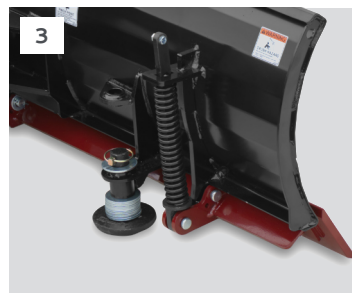
3. TRIP EDGE PROTECTS OPERATOR & EQUIPMENT