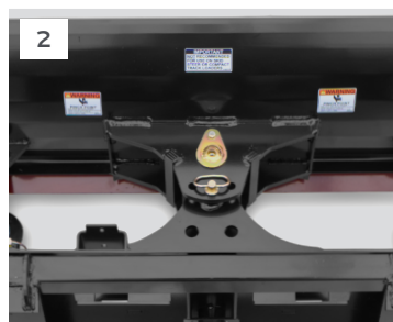
2. ANGLE THE BLADE 28° LEFT OR RIGHT