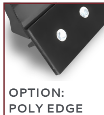
OPTION: POLY EDGE